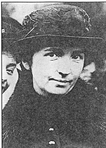
Sanger: Early eugenics revolutionary.

The abortion floodgates were flung wide open in the late 1960s after the public mind had been subjected to several decades of softening up and the organiza-